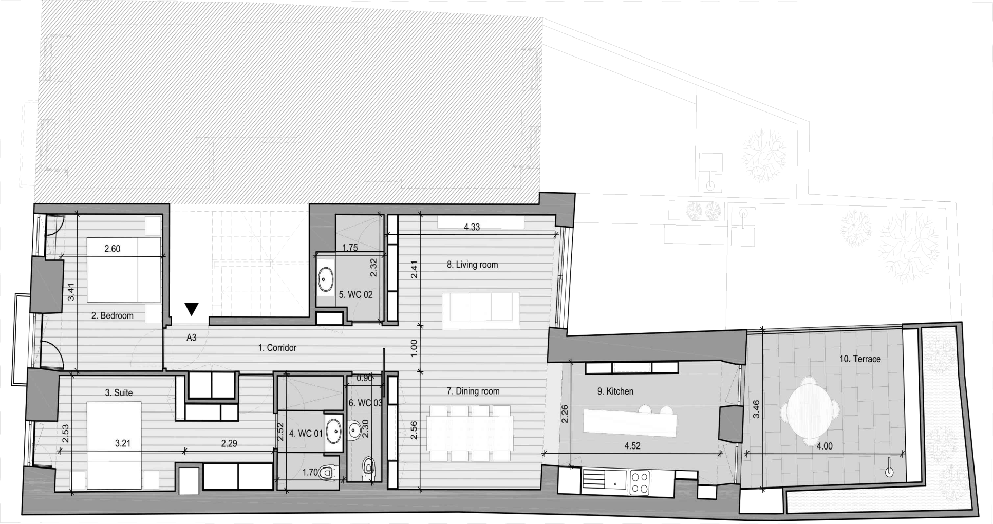
Apartment 3. 1st Floor